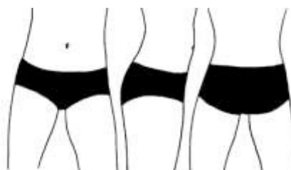
Minimum coverage for Female shorts